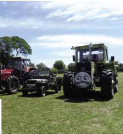
Contingency of vehicles for the Tractor Trek.