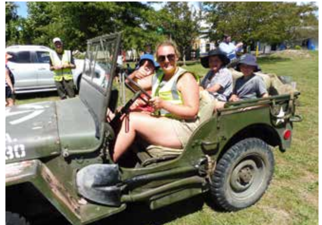
Ormond School pupils enjoying a ride around the school field